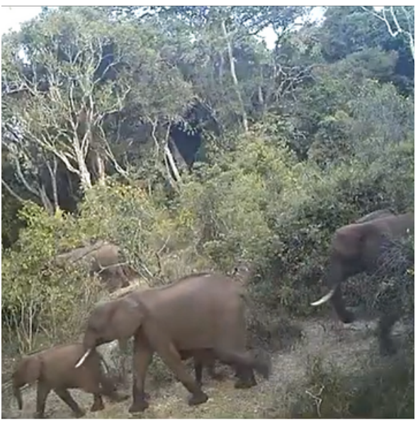
A herd of wild elephants caught on camera returning to the TreeSisters supported reforestation project in Mount Kenya

If the project continues reforesting as we are, then our struggles in life will lighten over time as we protect the forest.